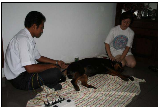
Patient Name: Morro; Male Rottweiler; Age - 5 years